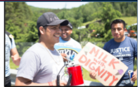
2019 Health and Safety Survey

Corporate power in the food industry allows large retail brands to buy milk for low prices, pushing down farm incomes and creating a downward pressure on farmworker wages and working conditions. After years of organizing farm by farm, Migrant Justice created the Milk with Dignity Program as a systemic solution to ensure protections for human rights in the dairy industry, and bring economic equity. Ben & Jerry's became the first company to join Milk with Dignity in 2017 covering 20% of Vermont's dairy industry. However, too many farms and farmworkers are still left out. In the fall of 2018, Migrant Justice farmworker leaders designed and carried out a survey with dairy farmworkers across Vermont to collect detailed information about the working and living conditions faced by workers outside the Milk with Dignity Program. The results of this survey show high rates of workplace injuries and illnesses and a severe lack of safety equipment and training. Dairy buyers must address these urgent health and safety challenges in their supply chains by joining Milk with Dignity, the only program with a proven record of securing human rights for farmworkers.